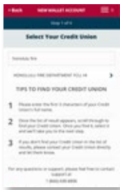
Register with Sprig by CO-OP