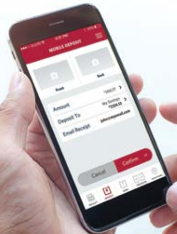
Deposit checks with Sprig by CO-OP

For a full list of features, visit GetSprig.com or for a quick review of getting started, see page 4.