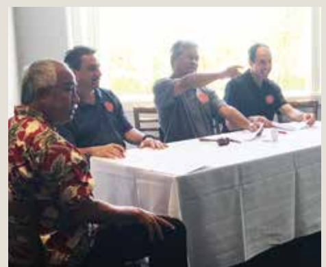
Board of Directors conduct the business meeting portion of the day. Bottom, annual report.